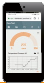
Real-time data on any mobile end device

Each device provides seamless high-resolution data measurements and compact live data for the dashboard.